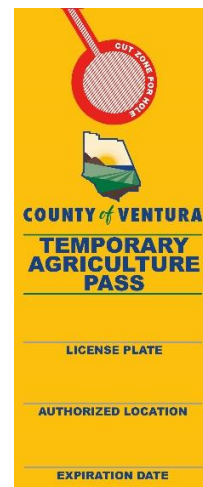
Hanging temporary pass issued by Sheriff Emergency Services during an incident.

To verify an Agricultural Pass, please call Sheriff's Emergency Services at 805-654-2757