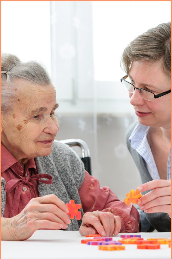
Programs for Special Populations