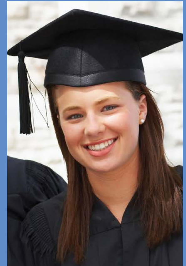
Making College Affordable